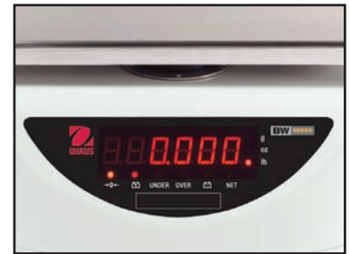
Dual Display "T" models have a second display on the rear of the scale