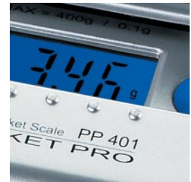
Backlit LCD display