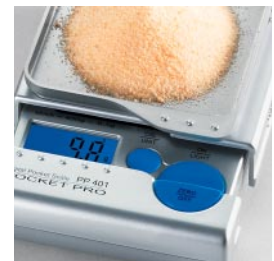
Removable weigh tray