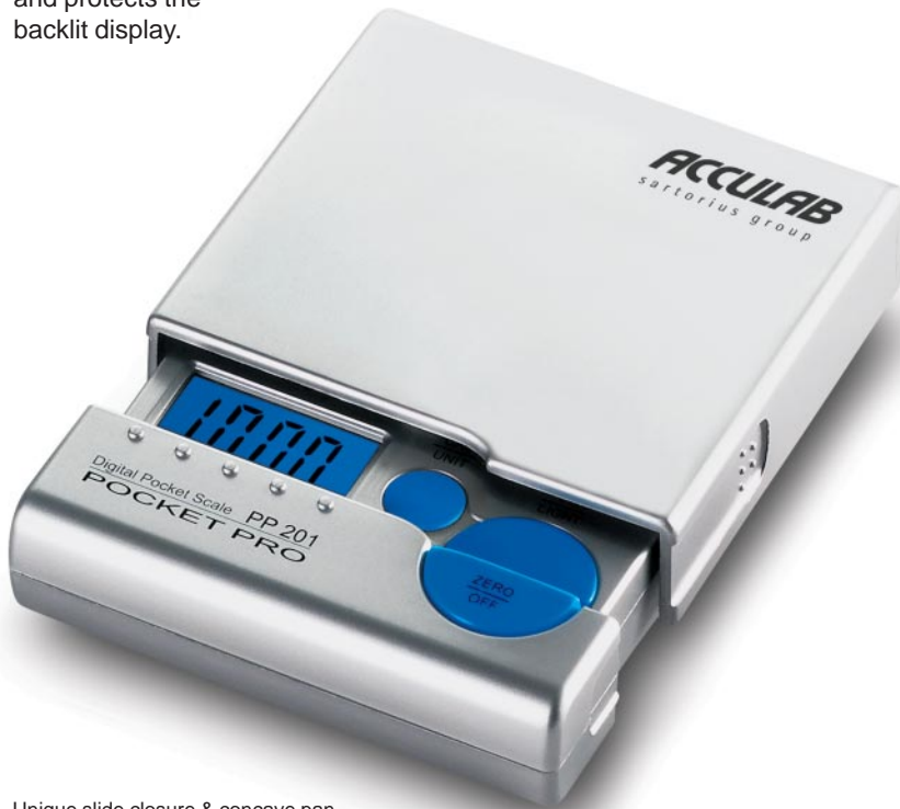
Unique slide closure & concave pan