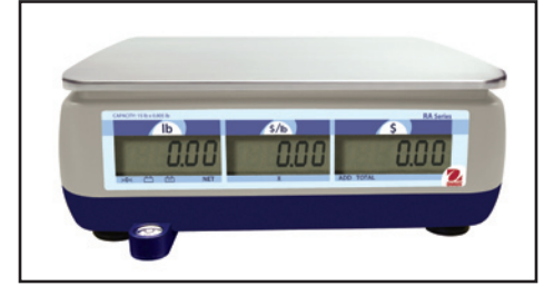
RA Series rear display