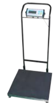
CPWplus - M