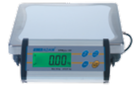
CPWplus - P