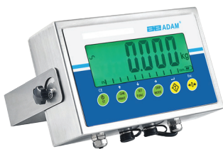
AE 403 Indicator