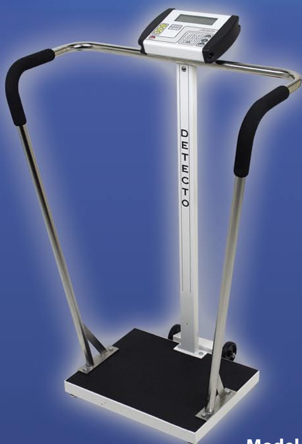
Model 6855 Waist-High Stand-On Scale 600 lb x .2 lb / 270 kg x .1 kg