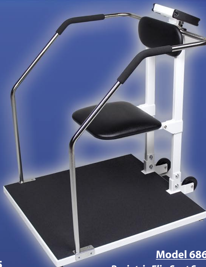
Model 6868 Bariatric Flip Seat Scale 800 lb x .2 lb / 300 kg x .1 kg